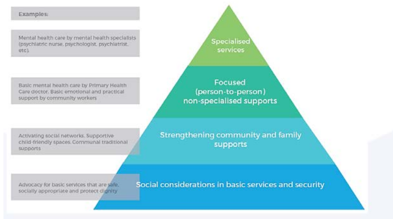
Figure 1: Intervention pyramid for mental health and social support 18

There were many reports, publications and websites from reputable organizations found in the grey literature that offered useful mental health mitigation to address the possible harms from the pandemic and for those who stayed at home as public health authorities recommended. These information sources provide advice on a variety of outcomes that focus on different levels of the social-ecological model. Because of the heterogeneous nature of the information found, we present these mitigation strategy results by social-ecological model level to better facilitate