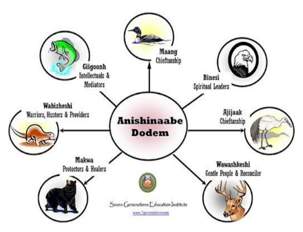
Figure 1: First Nations Clan System (7)

This inherient gift and responsibility, has been hindered by attempts of assimilation, colonization and cultural genocide and is now being exacerbated by the effects of a changing climate. The devistating destruction of our natural environment to meet the ever growing economic greed are now compounded by the alterations that are occuring to the environment due to climate change. These changes are having and will continue to have devastating affects on the health and well-being of Ontario's population but evenmore so the Indigeous peoples because of this interconnectedness.