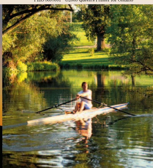
PIBS 5097e01 ©2008 Queen's Printer for Ontario