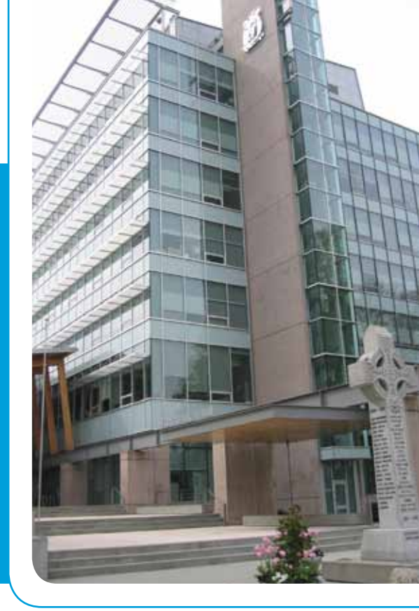
Richmond British Columbia City Hall

Top performers will be recognized and profiled in the spring of 2011.